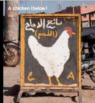
A chicken (below)