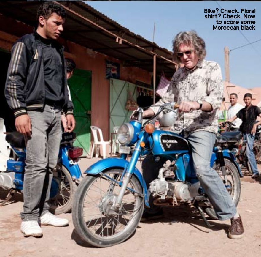
Bike? Check. Floral shirt? Check. Now to score some Moroccan black